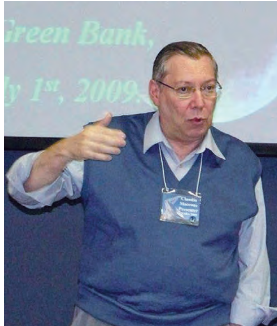
U.S. Department of Energy

Claudio Maccone: Well, the situation is pretty clear nowadays. We know that there are about over 300,000 rocks in the Solar System, basically asteroids, but also big, dead comets, or comets, or whatever. And the vast majority are rocks smaller than 1 kilometer [in diameter]. Now, this means that it is not easy to see them with telescopes. Nowadays, we can see them because we have automatic systems of telescopes taking care of the orbits immediately—as soon as they take the digital picture of the part of the sky with the asteroid—they can immediately compute the