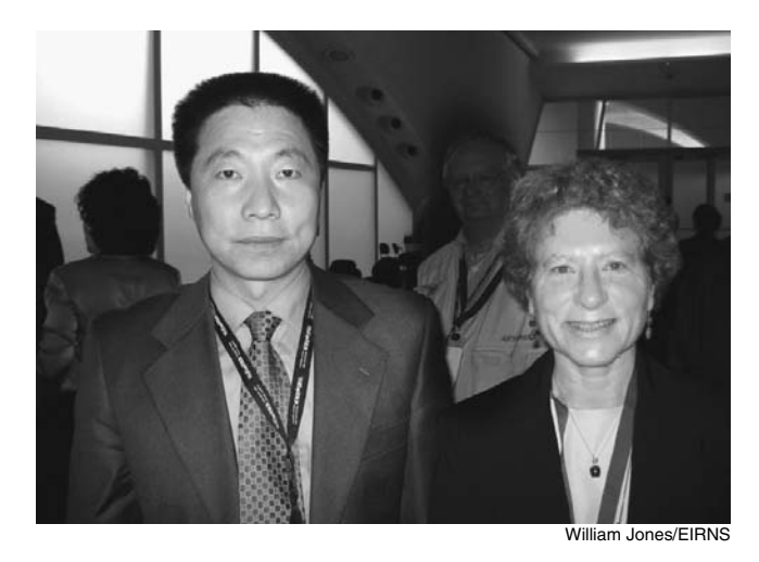
China's first astronaut, Yang Liwei, here with the author, at the annual Congress of the International Astronautical Federation, held in Valencia, Spain, in October 2006.

Griffin said. On the question of cooperation, Griffin explained that "the problems of spaceflight, whether human or robotic, are very difficult. They are right at the edge of what is technically possible, and, indeed when nations become able to conduct spaceflight activities . . . it is a symbol of very significant technological prowess. . . . [O]ne of things that we derive from international cooperative activities is seeing how different nations and