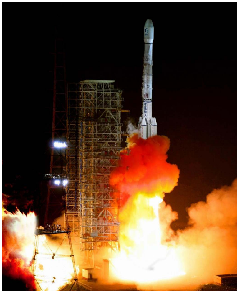
China's Long March 3B Rocket. The next in the series, the Long March 9, is designed to be a super-heavy carrier rocket which can carry 130,000 kg to low earth orbit (LEO). This will break the record set by Saturn V which brought Americans to the Moon.

Returning the planned five pounds of samples of lunar soil and rocks will allow a detailed analysis of the Moon's minerals, chemistry, and other characteristics, which is a necessary step to precede sending people there. Zhang described the activity of a lunar base as setting up agricultural and industrial production, producing medicines in the vacuum environment, and "energy reconnaissance."