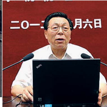
Jiao Tong University

Ouyang Ziyuan, the “father of the Chinese lunar program,” began lobbying the Chinese government for a Moon program in the 1990s, and was the first chief scientist of the Chang’e project. He said that, beyond the Earth, “we also need to know our brothers and sisters like the Moon, its origin and evolution and then from that we can know about our Earth.” Above, the Chang’e-3 rover on the Moon, December 2013.