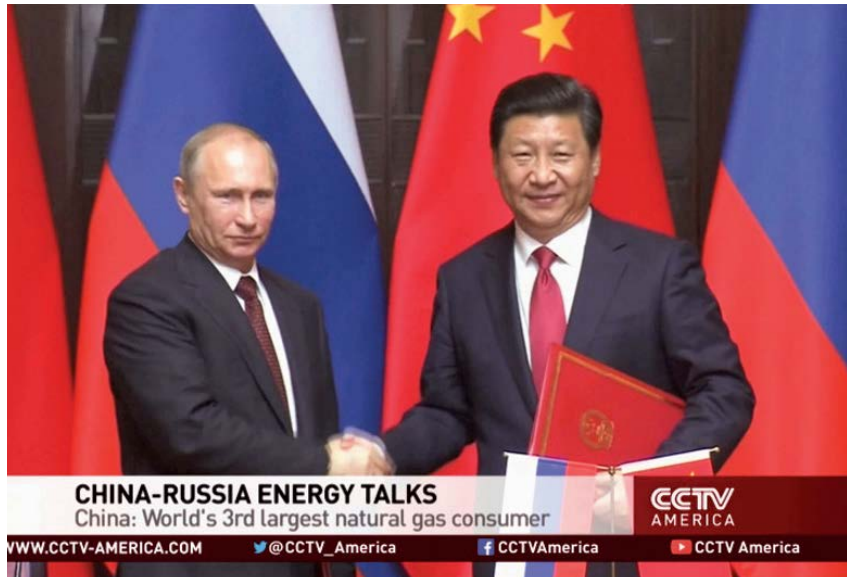
The deepening of collaboration between Russia and China was recently given voice by Russian Deputy Prime Minister Dmitri Rogozin, who said, “If we talk about manned space flights and exploration of outer space, as well as joint exploration of the Solar System, primarily the Moon and Mars, we are ready to go forth with our Chinese friends, hand in hand,” Here, Presidents Putin and Xi shake hands on a huge natural gas deal in May.