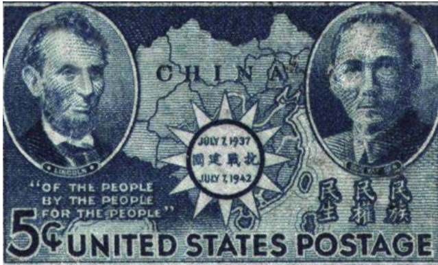
United States Postage Stamp issued July 7, 1942, reflecting the philosophical connection between Lincoln's American System and Sun Yat Sen's vision for China.

its origin in the United States. The bulk of that technology comes out of the scientific and productive potential built up under the leadership of Franklin Roosevelt, and in the echoes of his legacy, as under the Eisenhower and Kennedy administrations, with, for example, the Manhattan Project, Atoms for Peace, and the Apollo missions. It was out of these projects that the world got nuclear power, atomic medicine, and deep-space exploration capabilities, with leading scientists from around the world emigrating to America to participate in the advancement of human progress.