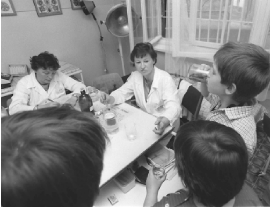
Children in Poland taking stable iodine in a Lugo solution, after the Chernobyl accident in 1986, to prevent their thyroids from absorbing radioactive iodine. The author, who was involved in this precaution, points out that it turned out to be unnecessary.