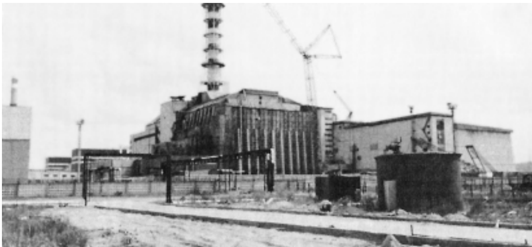
The damaged Chernobyl plant in 1992. The accident led to the first in-depth study of the long-term effects of low-level nuclear radiation, carried out by UNSCEAR.

Soon, to our relief, we found that the isotopic composition of radioactive dust was not from a nuclear explosion, but rather from a nuclear reactor. Reports that flowed in successively from our 140 monitoring stations suggested that a radioactive cloud over Poland travelled westwards, and that it had arrived from the Soviet Union; but it was only at about 6:00 p.m. that we learned from BBC radio that its source was in Chernobyl.