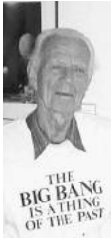
San Francisco Sidewalk Astronomers