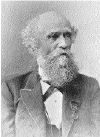
University of California, Berkeley, The Blue and Gold Yearbook, 1896