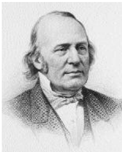
Portrait by Jean Louis Rodolphe, 1866

The economist, L. Brentano, illuminated the planetary significance of this phenomenon with the following striking computation: If a square meter were assigned to each man, and if all men were put close to one another, they would not occupy the area of even the small Lake of Constance between the borders of Bavaria and Switzerland. The remainder of the Earth's surface would remain empty of man. Thus the whole of mankind put together represents an insignificant mass of the planet's matter. Its strength is derived not from its matter, but from its brain. If man understands this, and does not use his brain and his work for self-