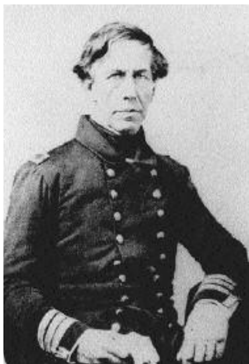
NOAA Central Library

Louis Agassiz (1807-1873), introduced the idea of the glacial period into science.