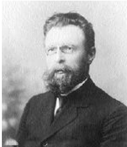
Russian Academy of Sciences

As for the coming of the noösphere, we see around us at