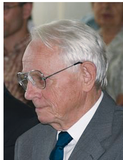
A more recent portrait.

I have published about 100 articles in Polish newspapers and popular science