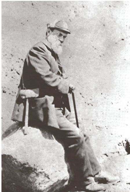
Vladimir I. Vernadsky on expedition, c. 1910.

Vernadsky combined rigorous research with profound thought, which soared above the common assumptions of his day. He is, therefore, a scientist and thinker who should not merely be celebrated and admired, but whose ideas should be promoted and developed.